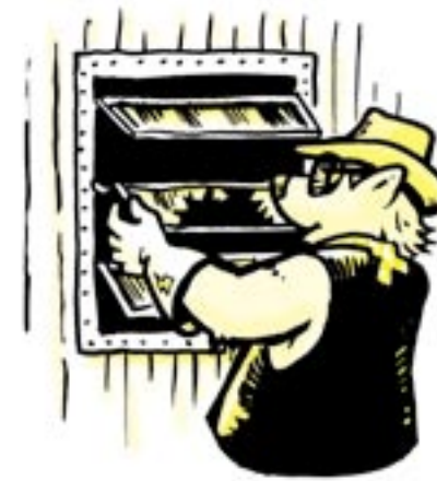
TYPICAL "JALOUSIE" WINDOWS LEAK AIR. THEY SHOULD BE REPLACED OR COVERED WITH STORM WINDOWS.

It's also important to regularly use exhaust fans in the kitchen and bathroom to maintain good indoor air quality and minimize moisture problems. Remember to ventilate constantly when using paints and other chemical compounds in the house.