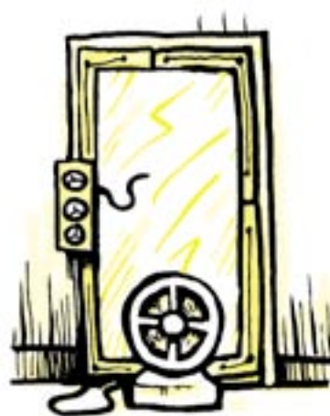
THE "BLOWER DOOR" CAN FIND HIDDEN AIR LEAKS.

Because of the wide construction variations of mobile homes, with the exception of installing plastic storm window kits that you can purchase at a hardware store, these measures will likely require the skills of trained professionals. Though you can also easily seal noticeable leaks around your home's windows and doors, these efforts will have little effect on your energy consumption if the big hidden leaks go untouched—leaks which are most easily found using a blower door, equipment commonly