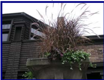
Frank Lloyd Wright's Home & Studio