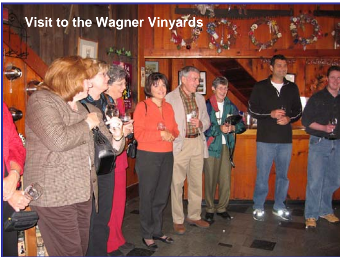
Visit to the Wagner Vinyards