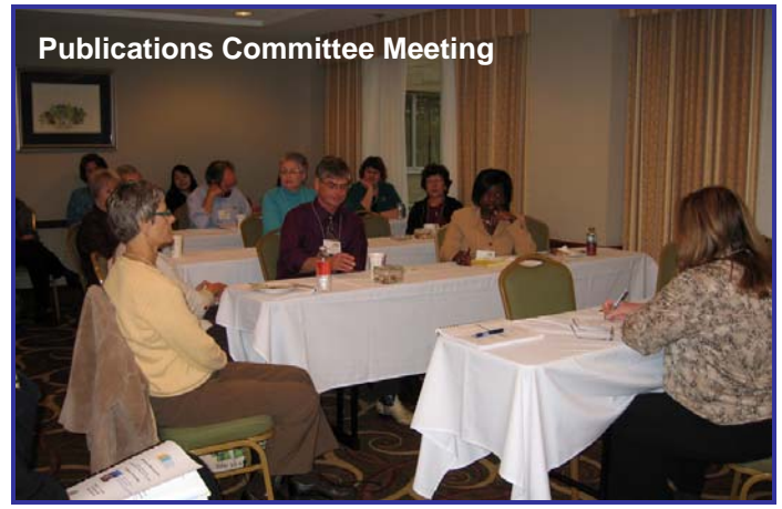
Publications Committee Meeting