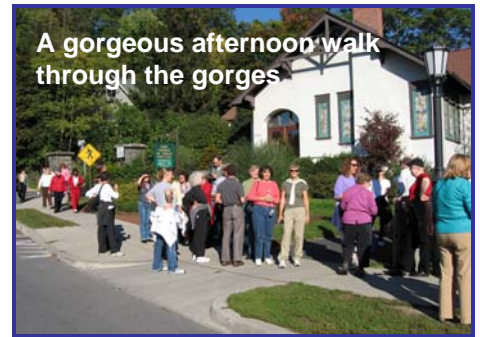
A gorgeous afternoon walk through the gorges