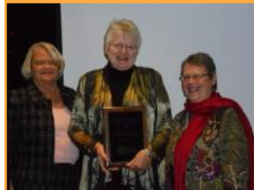
Mary Yearns Distinguished Service Award